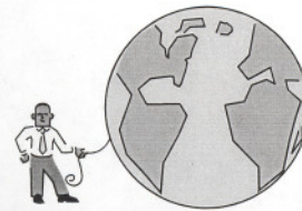
Be aware of your company's mission statement